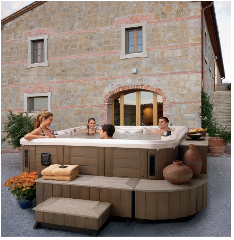
Epic spa featured with Step I, 48 in. / 121.9cm Storage Bench, Corner Bench and Counter Cabinets