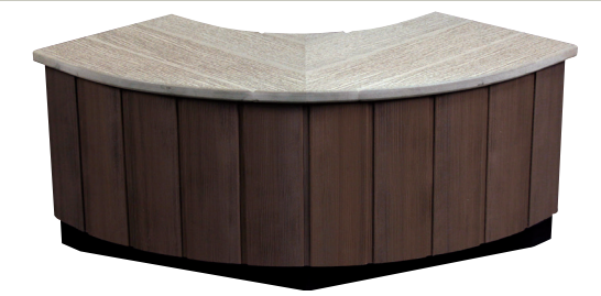
Corner Bench Sweeping radius fits nicely with the corner of the hot tub and is a great transition for the complete surround