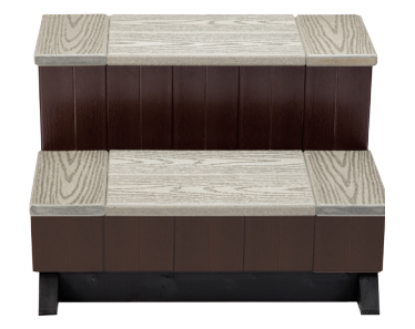
STEP II Standard or Hinged it makes the perfect entry step and stow away component