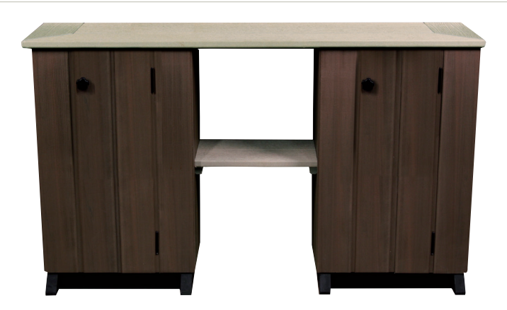
Counter Cabinet The ultimate for entertaining, this component stores all your hot tub items and makes a great bar table for spa side. Also useful as a standalone piece elsewhere on the patio