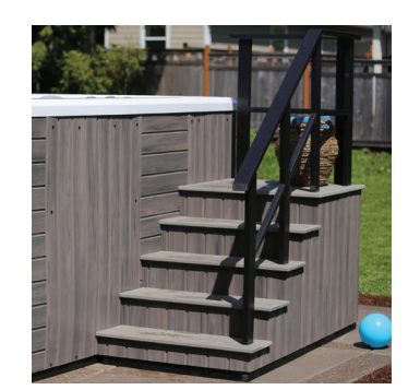
Aquatic Training Vessels™ Step Extruded composite handrail is smooth and sturdy and has an additional support bracket under the step frame which adds security. The notched handrail is made of material that will not splinter or wear like comparable steps made of wood. Available for right or left side.

Surround your Marquis® hot tub with custom Environments™ to transform your outdoor living area into your personalized hot tub lifestyle space and transform from hot tub to haven!