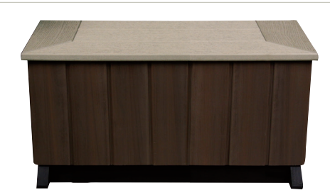
34" Storage Bench Creates a great entrance when used with Step I. Also is convenient for storing hot tub supplies