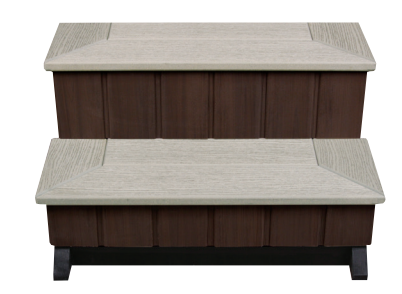
STEP II Standard or Hinged it makes the perfect entry step and stowaway component