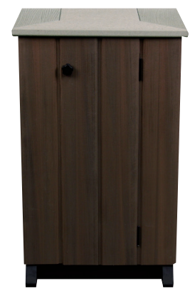
Storage Cabinet This versatile component can do double duty as a bar top and storage cabinet. Also useful as a stand-alone piece elsewhere on the patio