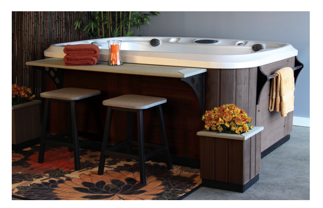
Fillers, shelves & extras Long Filler segments help create a full surround on your 90 in. / 228.6cm Signature hot tub. Shelves with brackets paired with two Stools provide a casual dining area. Planters and a Towel Bar add the perfect accent to your environment