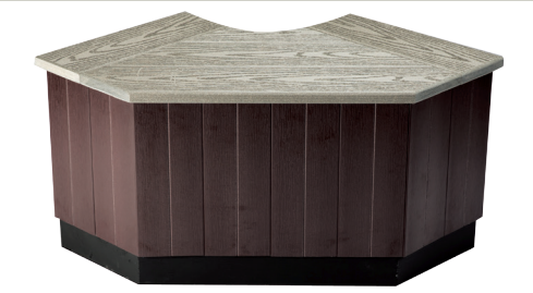
Corner Bench Angular radius fits nicely with the corner of the hot tub and is a great transition for the complete surround