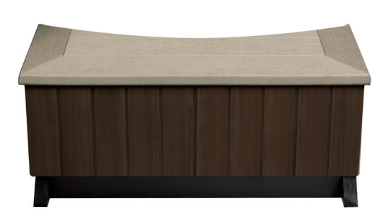
SPIRIT & RESORT STEP The gracious curved step matches up to the Spirit & Resort radius sides