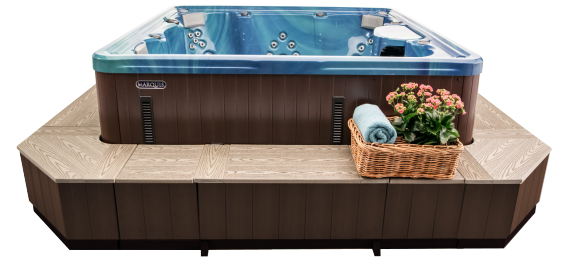
Full Surround Long & Short Filler segments are used to create a full surround to encompass your 84 in. / 213.4 cm e-Series™ hot tub